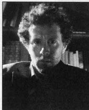
TJ Thyne as Lovell Milo in Shuffle

For more information about the film visit www.shufflethemovie.com